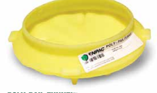
POLY-PAIL FUNNEL™ Part # 3005-YE Mounts to 3.5, 5, and 6-gallon tight-head pails. Also fits open-top pails with 12" diameter.