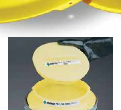
POLY-PAIL FUNNEL™ COVER Part # 3051-YE For use with Part # 3005-YE